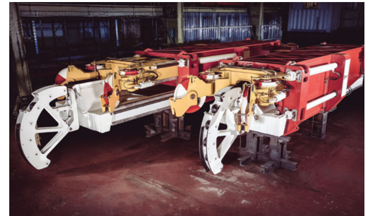
Main: External marine growth pile cleaner, supplied to Van Oord Small: Bespoke Umbilical & Guide-wire Handling system